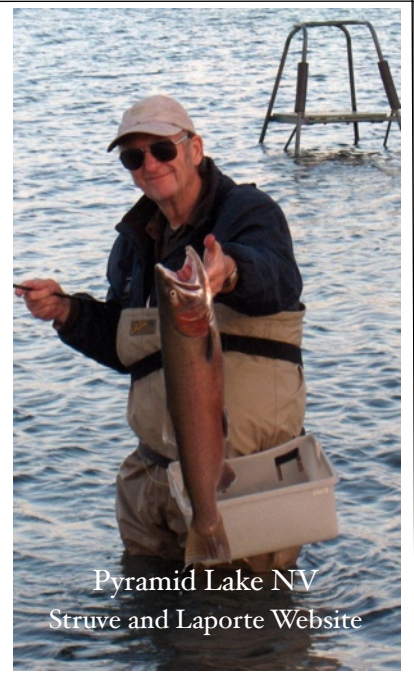
Pyramid Lake NV