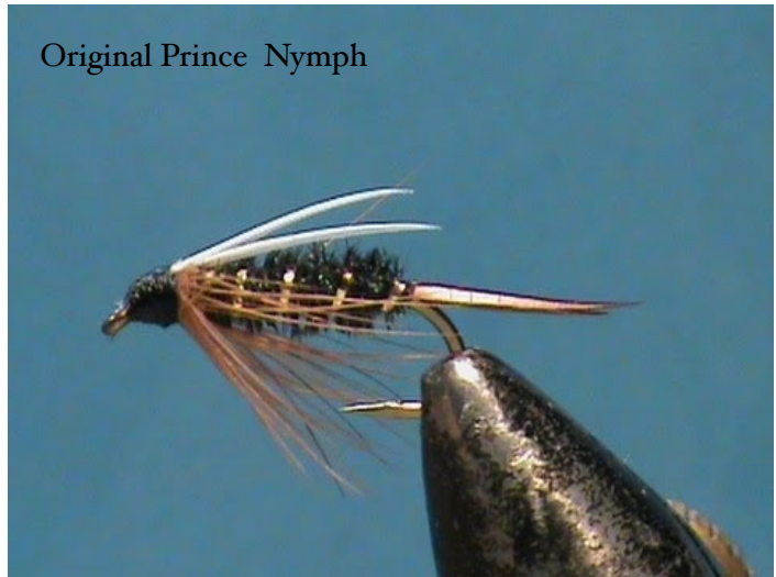
Original Prince Nymph

The original Prince nymph , also known as the Brown Forked Tail, can be used in lakes or streams. It was originated by Doug Prince of Monterey, CA in 1941 for fishing his favorite stream, the Kings River . Skip Morris indicates in his book "The Art of Tying the Nymph", that Doug Prince used Black Ostrich Herl for his original pattern then switched to Peacock Herl as a better choice because the material provided a very attractive iridescence to the body and has proven to be an excellent body material on other flies, such as the Zug Bug. Usually the white turkey biots used for the wing are turned down. However, in the original pattern, the wings were turned upwards. For Fly Tyers, the Prince Nymph can be a real challenge owing to the difficulty of positioning the goose biots used in the wing and tail. Rick Takahashi developed the " Go 2 Prince " as an easier to tie variation of the original. He substitutes White poly yarn for the white biot wing and brown hen hackle for the Brown biot tail, So the fly that you will be tying with Bill will look a bit different then the above picture. He also adds a Peacock Ice Dub collar to the front of the fly.